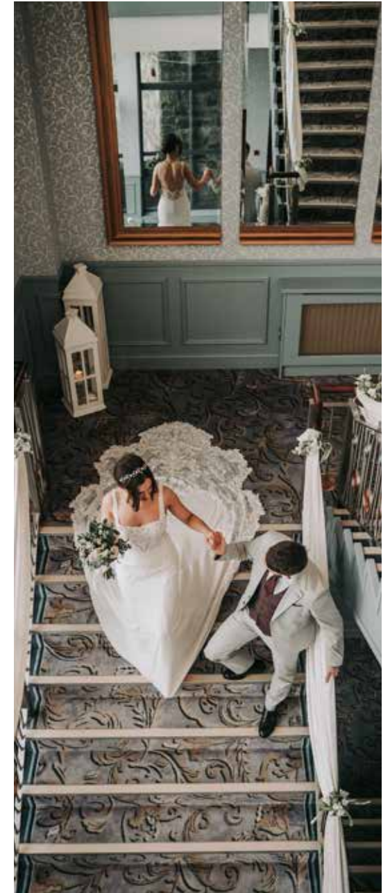
The Staircase 'The staircase made for wedding dress trains'